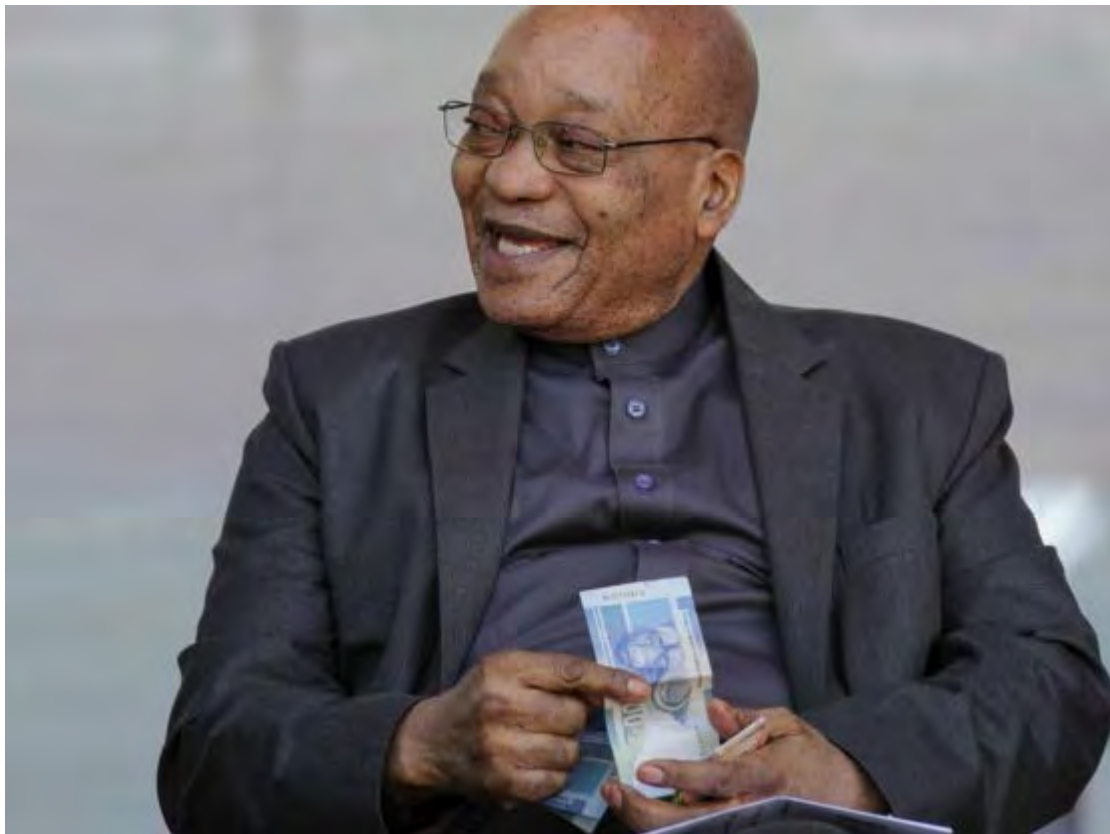
Jacob Zuma, South African President

Government employees could unwittingly be sucked into state capture through the increased purchases of debt in state-owned entities like Eskom using their retirement savings.