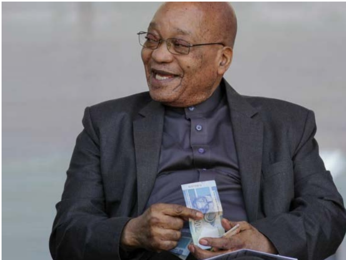
Jacob Zuma, South African President

Government employees could unwittingly be sucked into state capture through the increased purchases of debt in state-owned entities like Eskom using their retirement savings.