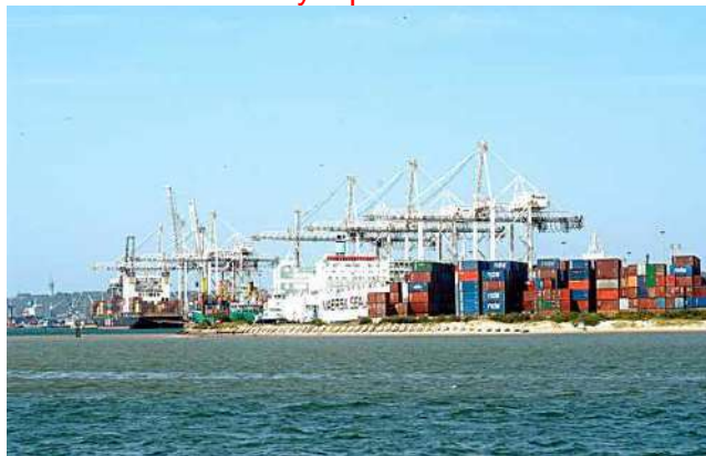
Durban harbour